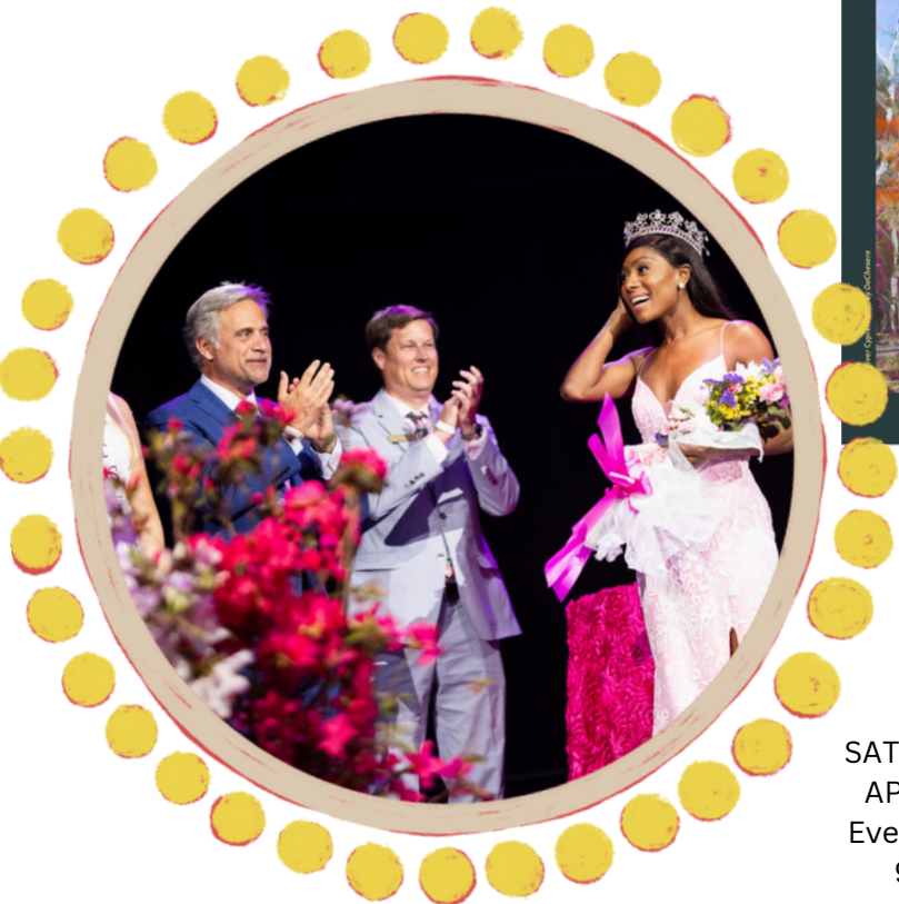
Queen's Coronation WEDNESDAY, APRIL 12 Event Time 2pm