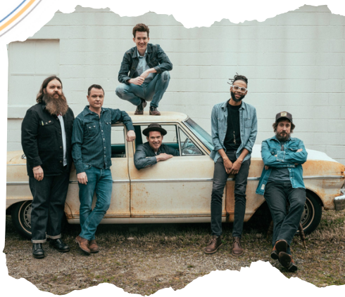
Old Crow Medicine Show Concert FRIDAY, APRIL 14 Event Time 7pm