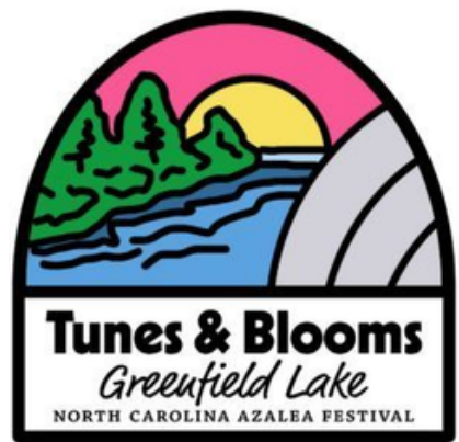
Tunes & Blooms Presented by Wilmington Grill SATURDAY, APRIL 15 Event Time 12pm