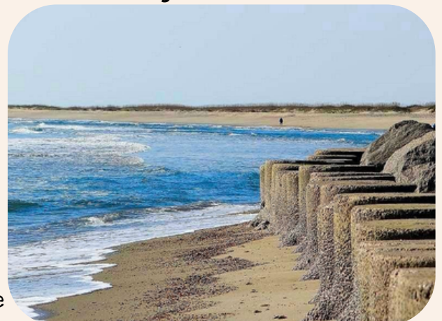
Left: Piping Plover Rt: Ft. Fisher shoreline