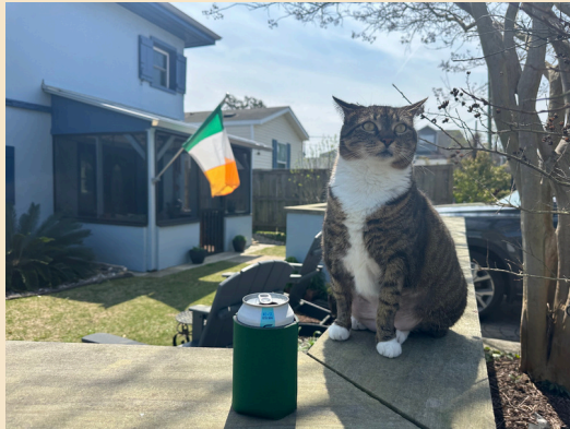
Socks the cat

Both schools are amazing and the kids are very happy there.