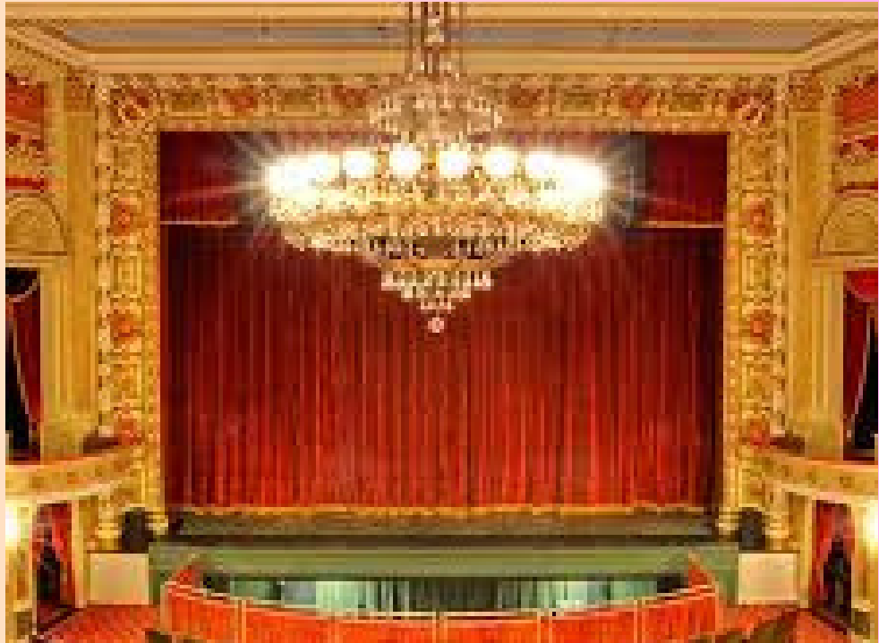
Thalian Hall stage

In 1983, under the direction of the Thalian Hall Center for the Performing Arts, Inc. (formerly the Thalian Hall Commission), a Master Plan for the expansion of the theatre and the renovation of the stage house was developed. The citizens of Wilmington overwhelmingly passed a $1.7 million bond issue for the Thalian Hall Renovation and Expansion Project in 1985. The Commission changed its name to the Thalian Hall Center for the Performing Arts, Inc. in 1986 and launched a major capital campaign. Thanks to the magnificent response by the state and the private sector, over $2 million was generated for the effort, with the City of Wilmington providing the remainder of the funds. Construction on the $5.0 million project began in 1988, and took 18 months to complete. The expanded Thalian Hall/ City Hall complex reopened on March 2, 1990.