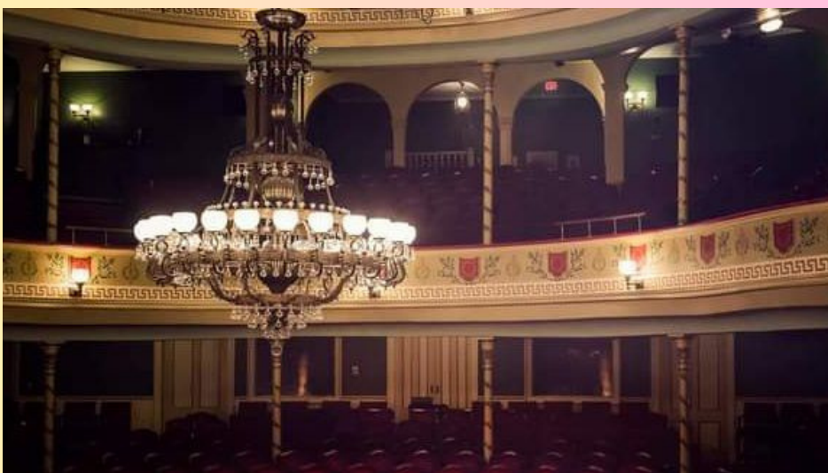
Thalian Hall theater

There were several close calls with demolition in the 1930's and 40's, but the citizens of the community always rallied for its preservation and the building was renovated. Following a small fire in the auditorium in 1973, the theatre was restored to its turn of the century appearance under the direction of the Thalian Hall Commission, Inc. After reopening in 1975, Thalian Hall witnessed a dramatic increase in use by professional artists and community groups, and audience attendance rose.