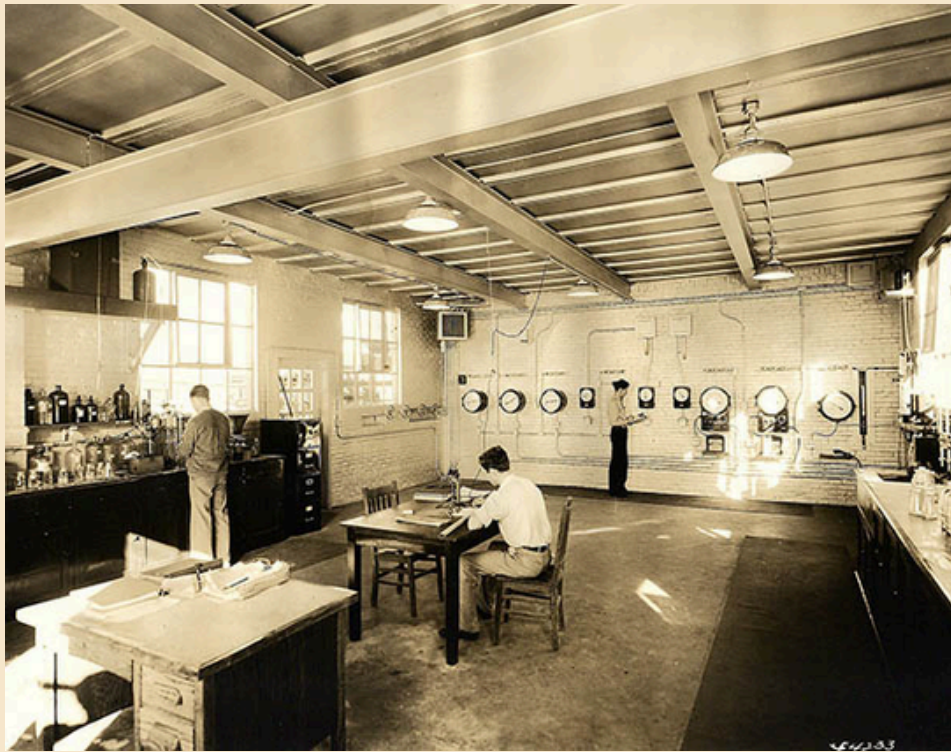
The plant's control room and lab.