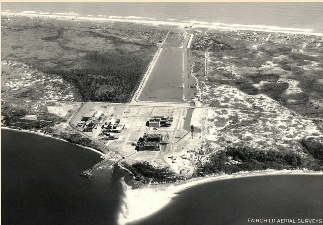
Overall view of the Ethyl-Dow Chemical Plant in the 1940s.

Next chapter: Fact or fiction: Kure Beach, N. C., July 25, 1943, at around 3 a.m., Germany attacked the United States when a surfaced submarine fired five rounds at the local Ethyl-Dow chemical plant intending its damage.